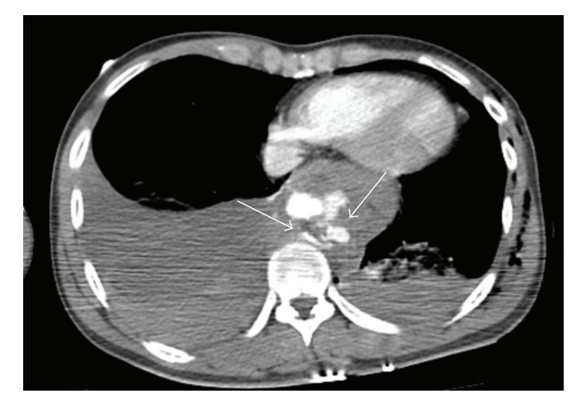
FIGURE 2: Contrast-enhanced axial chest CT using the mediastinal window settings shows hematoma surrounding trachea posteriorly and aorta circumferentially in the posterior mediastinum.

Small caliber injury to the great vessels such as aorta, superior vena cava, and inferior vena cava can cause significant blood loss. In our case, soft-tissue density hematoma, surrounding trachea posteriorly and aorta circumferentially, was seen in posterior mediastinum. From this hematoma, adjacent to descending thoracic aorta, active contrast material leak was seen, and therefore this was considered as acute aortic rupture and contrast material extravasation due to aortic rupture.