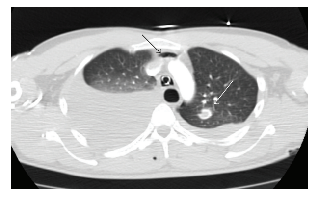
FIGURE 1: Contrast-enhanced axial chest CT using the lung window settings reveals bilateral hemothorax, minimal pneumothorax, and intraparenchymal hematoma in left lower laterobasal segment.