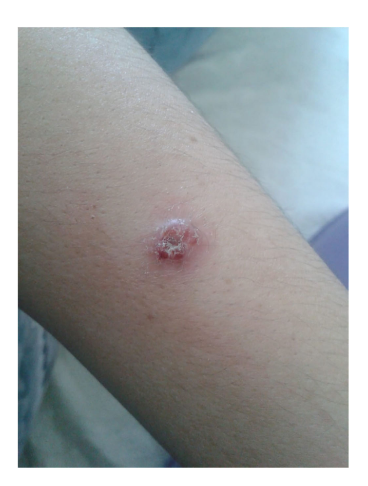
FIGURE 1 The appearance of the lesion of the patient at the time of admission (week 20)

In conclusion, it should be kept in mind that cutaneous leiomyomas can be confused with many tumoral and infectious diseases of the skin.