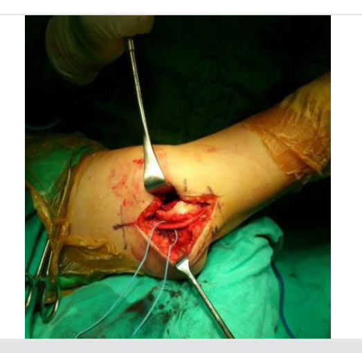
Figure 4. Medial incision, ulnar nerve dissection and protection. Subperiosteal elevation of the flexor and pronator muscle origins and anterior capsule. Further inspection of the humero-ulnar joint to find any bony block, loosing body or fibrous tissue

Figure 3. Elevation of the capsule from the lower end of humerus, radiocapitellar joint debridement in combination with anterior capsulectomy. Neurovascular bundle protection by a retractor. Dissection of the posterior aspect of the humerus to free the capsular attachment. Excision of fibrous tissues and loosing bodies from the olecranon fossa