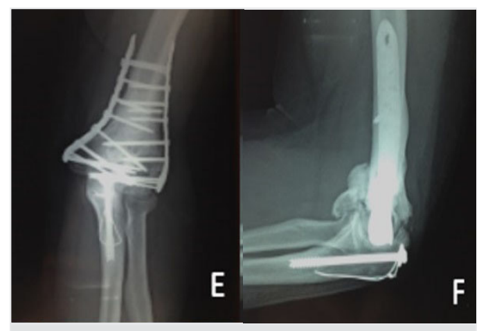
Figure 7 E-F. Two year post-operative x-rays showed severe heterotopic ossification formation especially around anterior elbow capsule

of the pathology. Pain relief was obtained by using inter-scalene catheter and intravenous ports. Drains were discontinued and early active assistive motion and continuous passive motion (CPM) exercises for flexion-extension and supination-pronation within tolerable limits of pain were initiated one day after surgery under the supervision of the physiotherapist. Nighttime splinting was continued for the deficient in motion for 3 weeks.