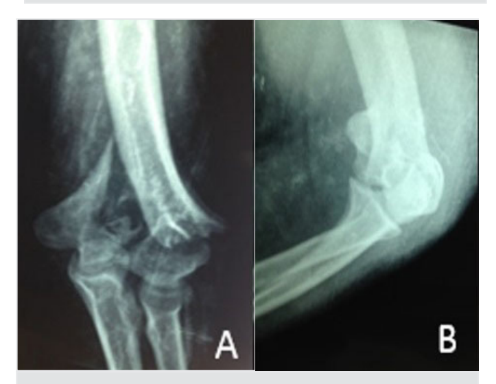
Figure 7 A-B. Initial distal humerus T type fracture