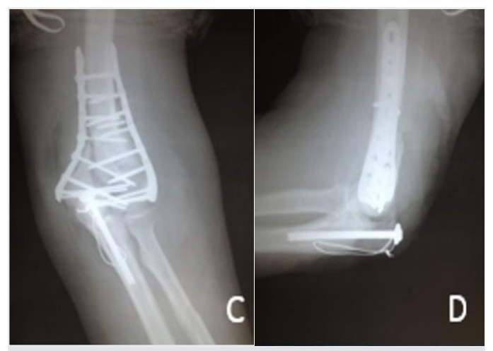
Figure 7 C-D. Intra-operative X-ray of distal humerus internal fixation as well as olecranon osteotomy

Post-operative physiotherapy and medication were chosen for each case upon the pre-operative and peri-operative evaluation