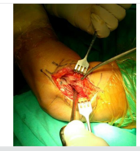
Figure 2. Lateral incision, subperiosteal elevation of lateral extensors (extansor carpi radialis longus and bracioradialis muscles) and dissection of the anterior capsule