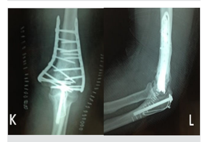
Figure 7 K-L. Early post-operative x-ray showed sufficient removal of heterotopic bones