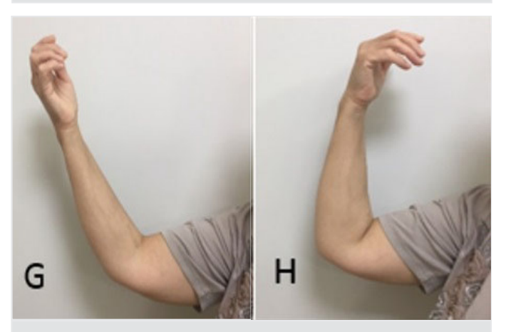
Figure 7 G-H. Limited elbow range of motion due to heterotopic ossification and joint capsule contracture