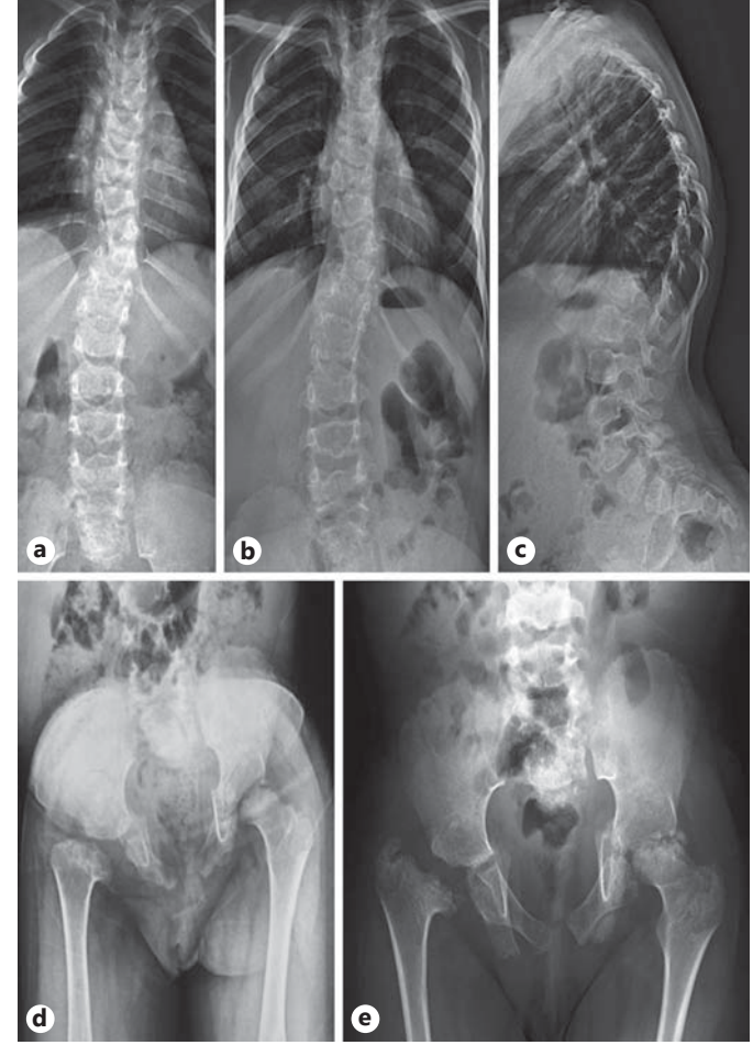
Fig. 5. Radiographs of patient 2 at the age of 5 ( a ) and 7 years ( b , c ). Spinal involvement with irregular size and shape of vertebral bodies and mild thoracolumbar scoliosis is shown. During the follow-up period, mild deterioration in scoliosis was detected. Pelvic radiographs show a hip dislocation, invisible femoral neck, and femoral capital epiphysis with irregular metaphyseal ossification of the proximal femur on the right side. The left femoral capital epiphysis appeared as fragmented ossicles at age 7 ( e ). Hypoplasia of the pubic bones also is present.

Spinal MRI confirmed thoracolumbar scoliosis and irregularity of vertebral bodies, mimicking segmentation anomalies of dorsal vertebrae. The laboratory investigations, ophthalmic examination, and hearing tests were normal. Her intelligence was appropriate to her age according to our clinical assessment and her achievements at school.