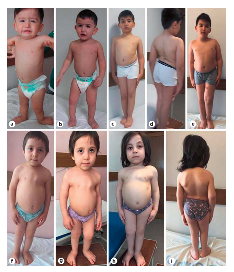
Fig. 1. Photographs of patients 1 and 2 at different ages. Patient 1 at 16 months ( a ), at 2.5 years ( b ), 8 years ( c , d ) and at 10 years and 10 months ( e ). Note: short stature with shortening of the right lower extremity and lumbosacral scoliosis. Patient 2 at 4.5 years ( f ), 5.5 years ( g ), and 7.5 years ( h , i ). Short stature, barrel-shaped thorax, thoracolumbar scoliosis, upper and lower limb length asymmetry on the right side are shown.

thies. However, a further case of DSC without unequal limbs was reported in which no pathogenic mutation was identified, suggesting that DSC is genetically heterogeneous [Tran Mau-Them et al., 2014]. Recently, Merrick et al. [2015] also reported a mutation in COL2A1 in a patient with DSC.