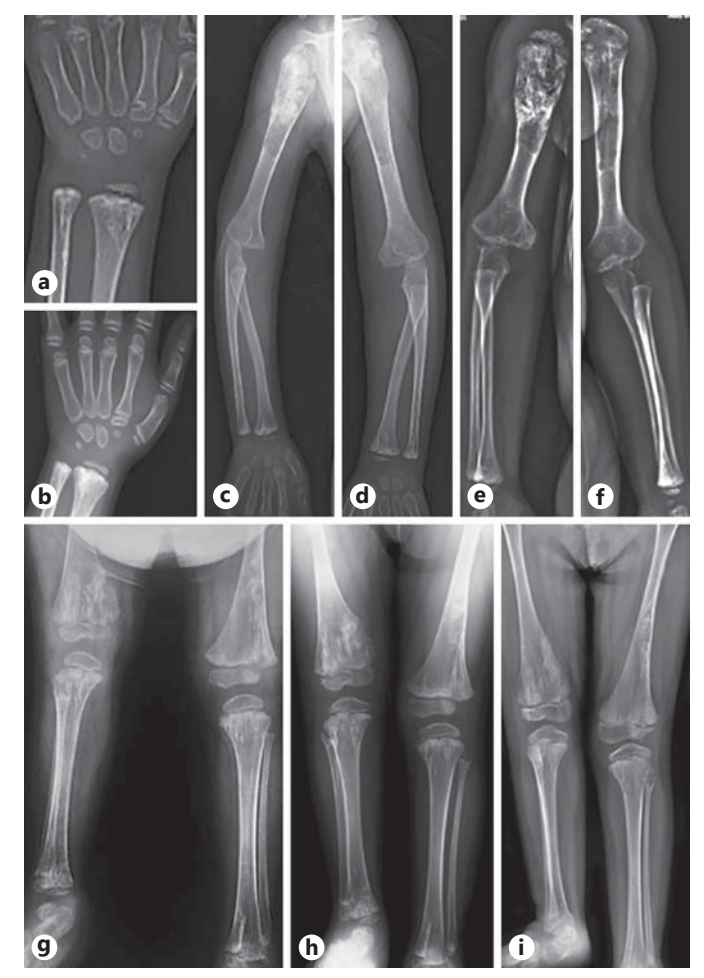
Fig. 4. Radiographs of patient 2. Metaphyseal expansion and enchondroma-like metaphyseal changes of distal radii at age 4 ( a ) and at 6 years of age ( b ). The upper extremities at age 4 ( c , d ) and 7 ( e , f ) show that the right side is shorter than the left. Enchondroma-like metaphyseal changes of proximal humeri progressed towards diaphysis with aging ( e ). The lower extremities at age 4 ( g ), 5 ( h ), and 7 ( i ) reveal shortening of right side, cystic radiolucency, and irregularity on the metaphysis and diaphysis of the long tubular bones, predominantly femora and tibias. During the follow-up period, mild regression of the metaphyseal irregularity was observed ( i ).

bar scoliosis were detected (Fig. 5a, b). The pelvis graphy showed hypoplasia of the pubis and absence of the right femoral neck and right femoral capital epiphysis with irregular metaphyseal ossification of the proximal right femur. The left femoral capital epiphysis was small and irregular (Fig. 5d).