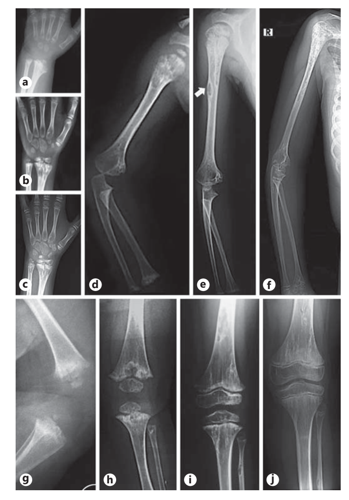
Fig. 2. Radiographs of patient 1. Metaphyseal expansion and enchondroma-like metaphyseal changes of distal radii at 1 year ( a ), at 6 years ( b ), and at 8 years of age ( c ). Radiographs of the right arm at age 1 ( d ), age 4 ( e ), and age 9 ( f ). The arrow shows an enchondromatous lesion on the diaphysis of the humeri ( e ) and its ossification during the follow-up period ( f ). Radiographs of the left knee at 3 months of age ( g ), at age 1 ( h ), age 4 ( i ), and age 10 ( j ) reveal enchondroma-like metaphyseal changes on distal femurs and proximal tibias. During the follow-up period, metaphyseal enchondromatous lesions resolved and progressed towards diaphysis.

mur at 3 years of age. Bone mineral density (BMD) assessment of the L1–L4 lumbar spine region by the Hologic Delphi technique and pediatric software analysis showed osteoporosis with a calculated Z score of -5.8. Endocrine, metabolic, and nutritional disorders that are associated with reduced bone mass were excluded. Intravenous pamidronate disodium treatment was given for 6 months. He suffered 2 fracture events of the right femur at age 6 and 7. At his last visit, at the age of 10, he was 119 cm (-3.39 SDS) tall and had a lower limb length difference of 2 cm. Taking his educational achievements and our clinical assessment into consideration, his intelligence was normal.