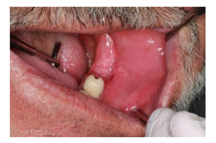
FIGURE 5 Intraoral appearance reveals that periodontal healing is uneventful

is strange not to encounter a DLBCL case in literature, either mandible or gastrointestinal tract simultaneously, until present case.