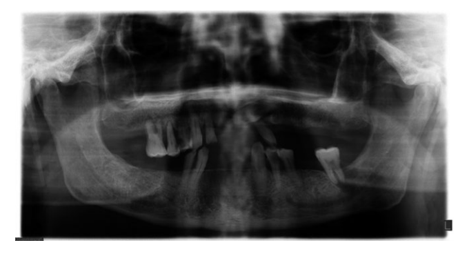
FIGURE 1 Diagnostic Panoramic Radiography Shows Border Irregularity and Radiolucency in Apical Area of a Second Left Molar in the Mandible