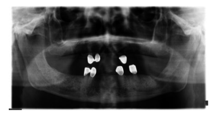
FIGURE 4 Panoramic Radiography was taken after 3 mo and Shows no Calcification in the Lesion