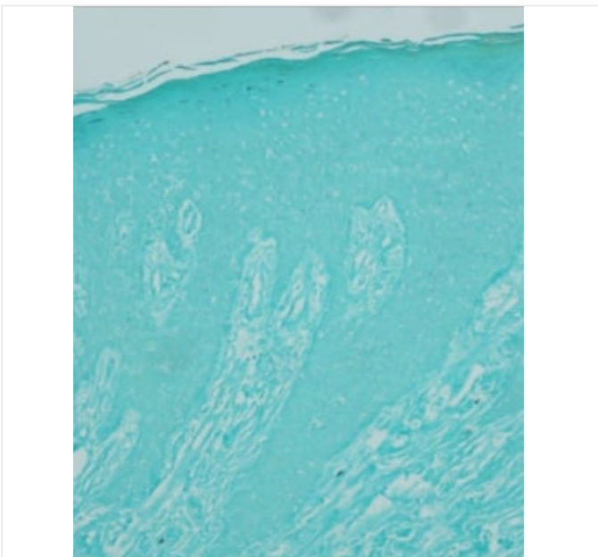
Figure 3. Grocott-Gomori's Methenamine Silver Staining to identify Candida colonization