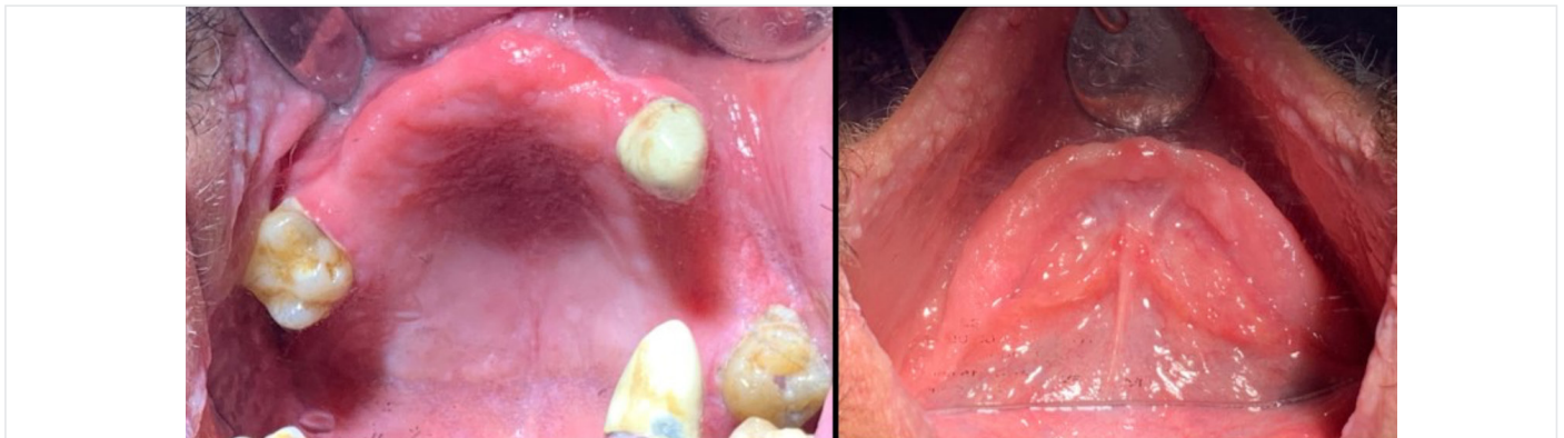
Figure 5. Clinical manifestations of a healthy oral mucosa after a 2-month healing period

in disease diagnosis and patient management. Clinicopathologic correlation and collaboration can prevent diagnostic pitfalls. Differential diagnosis should be rendered by the pathologist and clinicians based on the histopathologic and clinical presentations of the lesion. In this patient, malignant conditions and HPV-induced lesions were excluded via histopathologic and immunohistochemical analysis. The patient will undergo further genetic investigations.