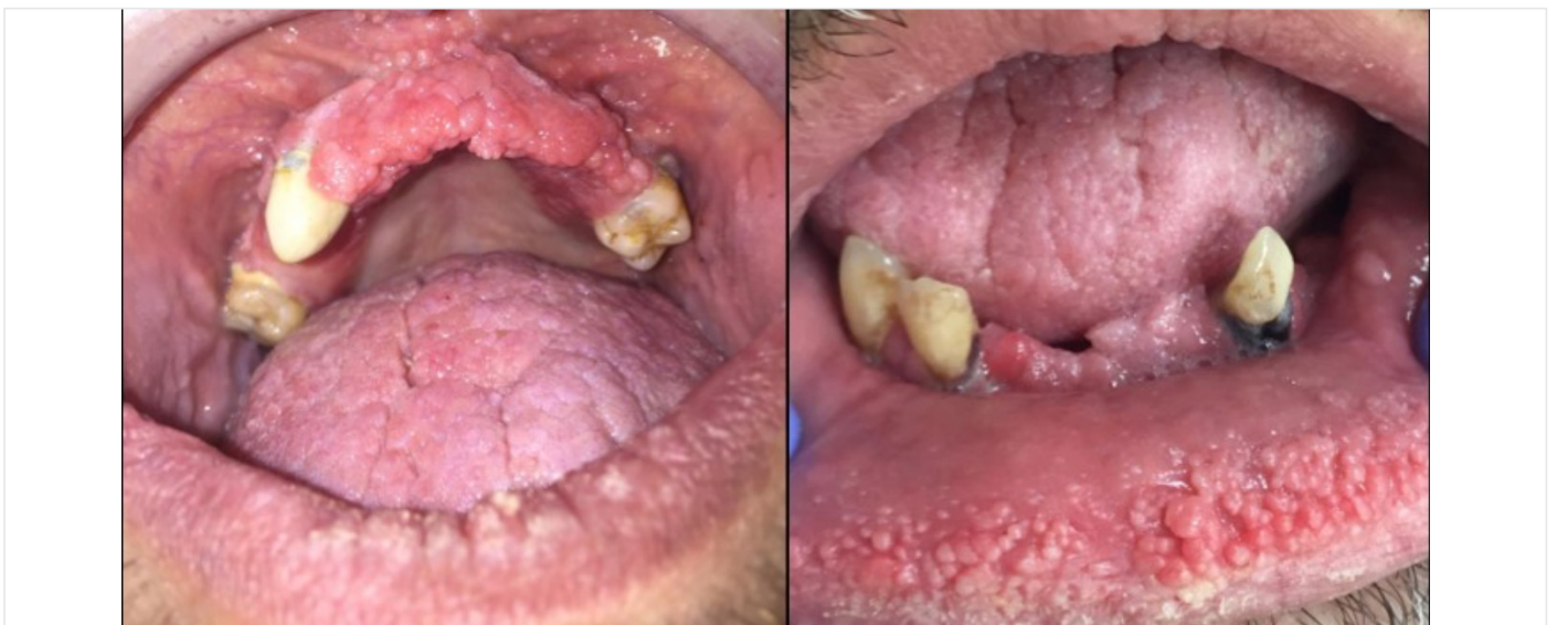
Figure 1. Clinical manifestations of the multifocal epithelial hyperplasia on the upper and lower jaws, lips, and tongue

The patient has undergone excisional biopsy and then, laser therapy was applied to the base of the lesion for stable and healthy mucosa for the prosthetic rehabilitation of the jaws. The hyperemic and papillary formations were resolved within a month (Figure 5). Removable prosthetic rehabilitation of the upper and lower jaw was achieved after a 2-month healing period.