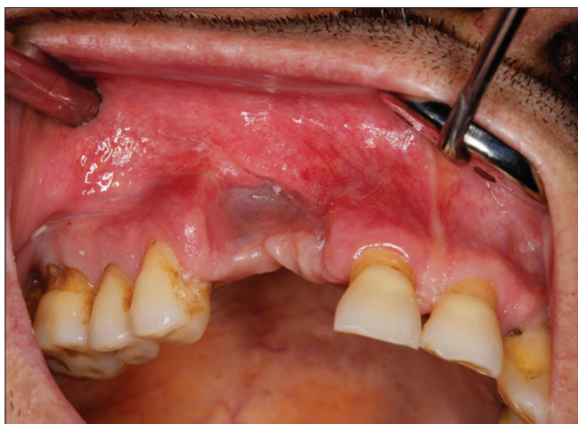
Figure 3: Postoperative view at the 3-month follow-up

Treatment methods indicated in EMP include local surgery (curettage of the lesion), local irradiation, systemic chemotherapy, or a combination of these methods. Solitary plasmacytomas are highly radiosensitive lesions. Radiation therapy, radical extensive surgery, or a combination of both is recommended as primary treatment. Radical radiotherapy in the range of 40–50 Gy has been shown to control disease by 80%. [5] The role of adjuvant chemotherapy is at present not clearly defined. The addition of chemotherapy to radiotherapy in the treatment of EMP has not been shown to decrease local recurrence or increase survival rates compared with local treatment with radiotherapy alone, and therefore, should be reserved for those patients progressing to MM. [6] Surgery is rarely necessary but may be required in situations where plasmacytoma involvement of the bone causes skeletal instability and high risk of fracture. In these cases, radiation therapy may be delayed until after surgery. [7] In the present case, patient was unable to close his lips due to the size and volume of the lesion. Hence, surgical excision was preferred for the diagnosis and treatment of the lesion. The patient continues to receive chemotherapy as arranged by oncologist.