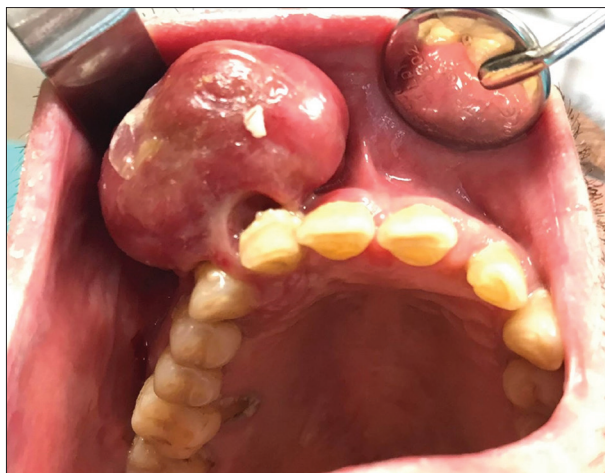
Figure 1: Intraoral view of the lesion. Note the erythematous, ulcerative, approximately 2 × 2 × 2 cm sized tumor

A 58-year-old male patient was referred to our clinic with swelling and pain in the right maxillary anterior region. On clinical examination, an erythematous, ulcerative, approximately 2 × 2 × 2 cm sized tumor was observed [Figure 1]. The patient failed to close the lips due to the size of the tumor. In addition, there was class 3 mobility in the associated teeth. The patient was on chemotherapy, taking warfarin and IV zoledronic acid for the treatment of MM. The excision of the tumor was planned because of pain during feeding. The patient was consulted to the Hematology Department to stop warfarin therapy. Within the approval of the Hematology Department warfarin therapy was stopped and the lesion was excised under local anesthesia when the INR level was 1.6. The teeth associated with tumor