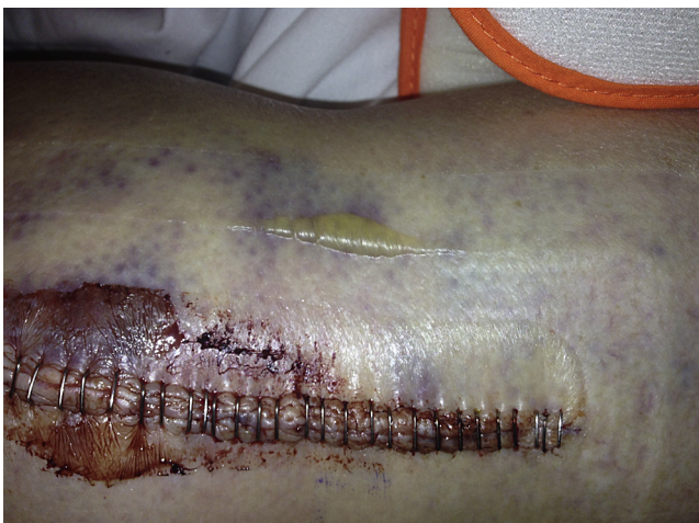
Fig. 3. An example of blistering on a total knee replacement patient.

The findings were similar when the patients were stratified by the type of joint. Within THA patients ( n = 293 ), patients in the intervention group had lower superficial SSI (2 of 144, 1.4%) than those in the control group (9 of 149, 6.0%, P = .06 ), lower deep/organ space SSI (intervention: 1 of 144, 0.7%; control: 2 of 149, 1.3%; P = 1.00 ), and less blistering (intervention: 1 of 144, 0.7%; control: 3 of 149, 2.0%; P = .62 ). The results were relatively similar in TKA patients ( n = 284 ), as the intervention cohort had lower superficial SSI (3 of 139, 2.2%) than the control cohort (10 of 145, 6.9%, P = .09 ), less blistering (intervention: 9 of 139, 6.5%; control: 16 of 145, 11.0%; P = .21 ), and 1 deep/organ space SSI (intervention: 1 of 139, 0.7%; control: 0 of 145, 0.0%; P = .49 ). However, none of these results were significantly different (Table 4).