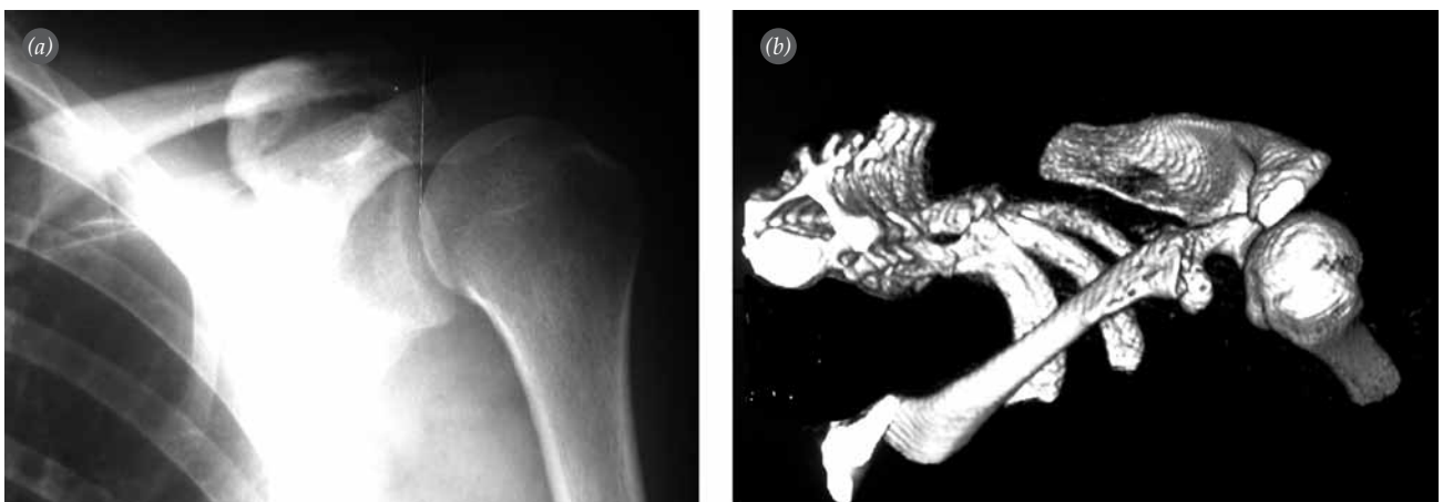
Fig 2. Postoperative 18th month (a) AP radiography and (b) 3D CT image.

with nonabsorbable sutures. Finally, the delto-trapezial fascia was carefully repaired over the top of the clavicle. The arm was immobilized in a shoulder immobilizer for three weeks. Active-assisted rehabilitation of the shoulder was initiated a week after the surgery. At the 5th postoperative week, full activity without restriction was permitted. Shoulder stretching exercises were initiated at the 8th postoperative week. Forced exercises were avoided until the 12th postoperative week. Radiographs of the shoulder showed significant coracoclavicular ossification with reduction of the coracoclavicular space after eighteen months (Fig. 2). Patient function was not assessed on any scale because of patient's preoperative general status. Two years after surgery she had no pain in the