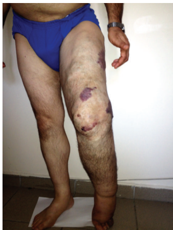
FIGURE 1: The appearance of the lower extremities of the patient showing shortness and thickness of the left leg with variceal enlargement of the veins and hemangiomas.

Key Message. The diagnosis of Klippel Trenaunay Weber syndrome may be delayed into adulthood and FSGS may coexist with this syndrome.