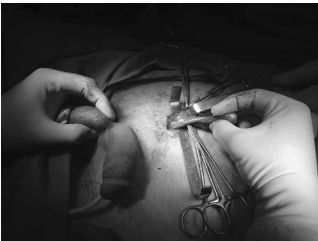
FIG. 2. Cord structures and vessels of ectopic testis were mobilized and taken out of the body through the right inguinal incision. The testicle was small in size ( \sim 7 mm), and the right testis was normal in size ( 3 \times 2 cm).

Testes are normally located in the scrotum at birth. Ectopic testis has been reported to occur at different sites, including the superficial inguinal pouch; suprapubic, femoral, and perianal areas; at the base of the penis; and in the transverse inguinal and scrotal region. 7 The most common ectopic location is within a superficial pouch between the external oblique and Scarpa's fascia, a structure called Denis Browne's pouch.