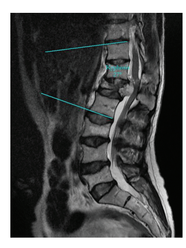
FIGURE 2: Preoperatively, the measured T12–L2 local kyphotic angle.

examination revealed an otherwise healthy individual with no history of disease before the pregnancy. She was 165 cm tall and weighed 63 kg, with a body mass index (BMI) of 23. It was understood from the patient history that, with weight loss after the birth, she had returned to her previous BMI. There was a Frankel D deficit in both lower extremities according to the Frankel classification, no ankle clonus and a negative Babinski reflex.