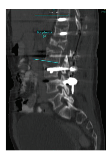
FIGURE 3: Postoperatively, the measured T12-L2 local kyphotic angle.

Pain increased on palpation of the back. The patient had difficulty standing and waking without support. Radiographs showed a burst fracture (the vertebral posterior complex was intact, but the fracture was in the anterior and middle compartment) of L1 associated with a vertebral hemangioma causing canal compression with expansion of the L1 body and a compression fracture of L3 secondary to postpartum osteoporosis (Figure 1). The T score was -3.5 SD on bone densitometry. The local kyphosis angle between T12 and L2 was 27° (Figure 2). Under general anesthesia, total decompression was performed with an L1 laminectomy and dural cut. During decompression, there was blood loss of approximately 500 mL, which was controlled by surgical packing at intervals. A total of 3 cc bone cement was injected