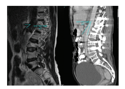
FIGURE 4: Preoperative and postoperative angle of superior mesenteric artery in computerized tomography.

with a vertebroplasty device (Kyphon, Sunnyvale, CA) to shrink the hemangioma of the L1 vertebra. The vertebra was stabilized with instrumentation with T11–L4 posterior pedicle screws without placing a screw in the L1 pedicle. Using the same system, the acute kyphotic deformity was corrected. Postoperatively, the measured T12–L2 local kyphotic angle was 9° (Figure 3). Twelve hours postoperatively, oral nutrition was allowed, but she developed nausea and vomiting. The oral nutrition was stopped and supportive treatment was started with intravenous serum.