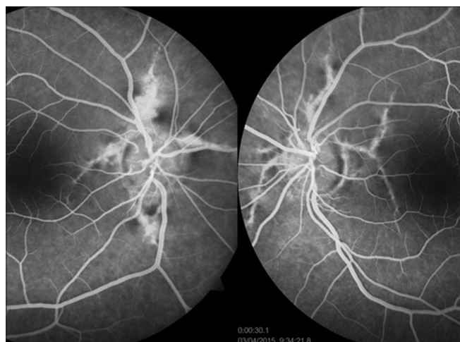
Figure 3: Fluorescein angiography showing linear hyperfluorescent streaks radiating from the optic disc in both eyes