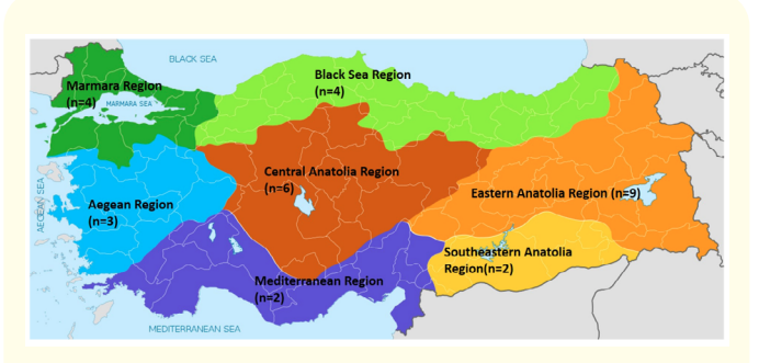
Figure 1: Honey samples (n = 30) were obtained from 7 different geographical regions of Turkey.

Thirty honey samples obtained from seven different geographical regions of Turkey were collected (Figure 1). The samples were stored in a dry and a dark place at room temperature. In order to determine antioxidant capacity, representing 7 geographical regions seven different honey samples of them were subjected to analyze. All samples were stored at 4°C in the dark until analyses and just before use for the experiments honey samples (10 g) were heated in an ultrasonic water bath (Memmert, Germany) for 15 min then, dissolved in distilled water.