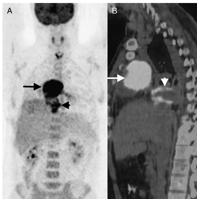
FIGURE 2. Maximum intensity projection PET (A) and sagittal PET/CT fusion (B) images showed recurrent hypermetabolic masses (arrows). Primary cardiac tumors are rare tumors, and approximately 25% of them were malignant. They consist of sarcoma (95%) and lymphoma (5%). 1 The most common primary cardiac sarcomas, which have poor prognosis, are angiosarcoma and rhabdomyosarcoma. Myxofibrosarcomas, which originated from myofibroblast, are nonvascular tumors and considered as myxoid variant of malignant fibrous histiocytoma. 2 In literature, there are a few case reports about FDG PET imaging of primary cardiac tumors. Mild FDG uptake was reported in benign primary cardiac tumors. Primary and secondary cardiac tumors showed increased FDG uptake. 3-13 In addition, pericardial tumors and pericarditis had increased FDG uptake. 14-16