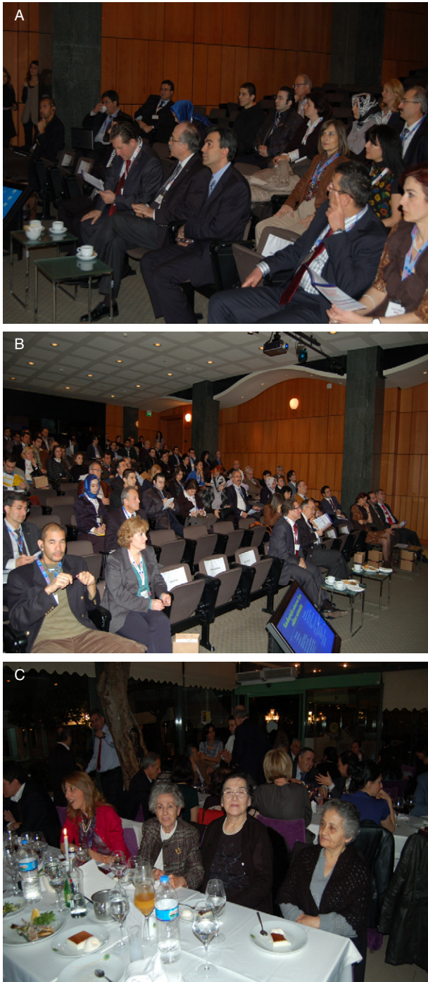
FIG. 5. (A–C) Participants and the Faculty Gala Dinner of the Third Istanbul Symposium at the American Hospital, Istanbul on December 17, 2011.

Istanbul, Turkey; Baskent University Istanbul, Acıbadem Bakırköy Hospital, and Acıbadem University all supported this event scientifically.