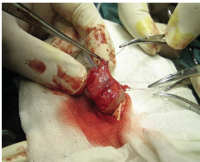
Fig. 4. One of the parts of the dartos flap carried laterally and placed onto the neourethra in order to cover it as a first layer.