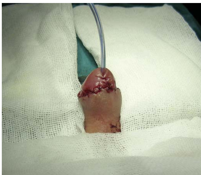
Fig. 6. Glans and skin closure.

force the layers (fig. 5). The upper edge of this part of the dartos flap was sutured to the glans wing at the opposite side with the same suture material. Glans and skin closure was then performed in the same way as with the TIPU procedure (fig. 6). Also, a suit-compressed dressing was applied.