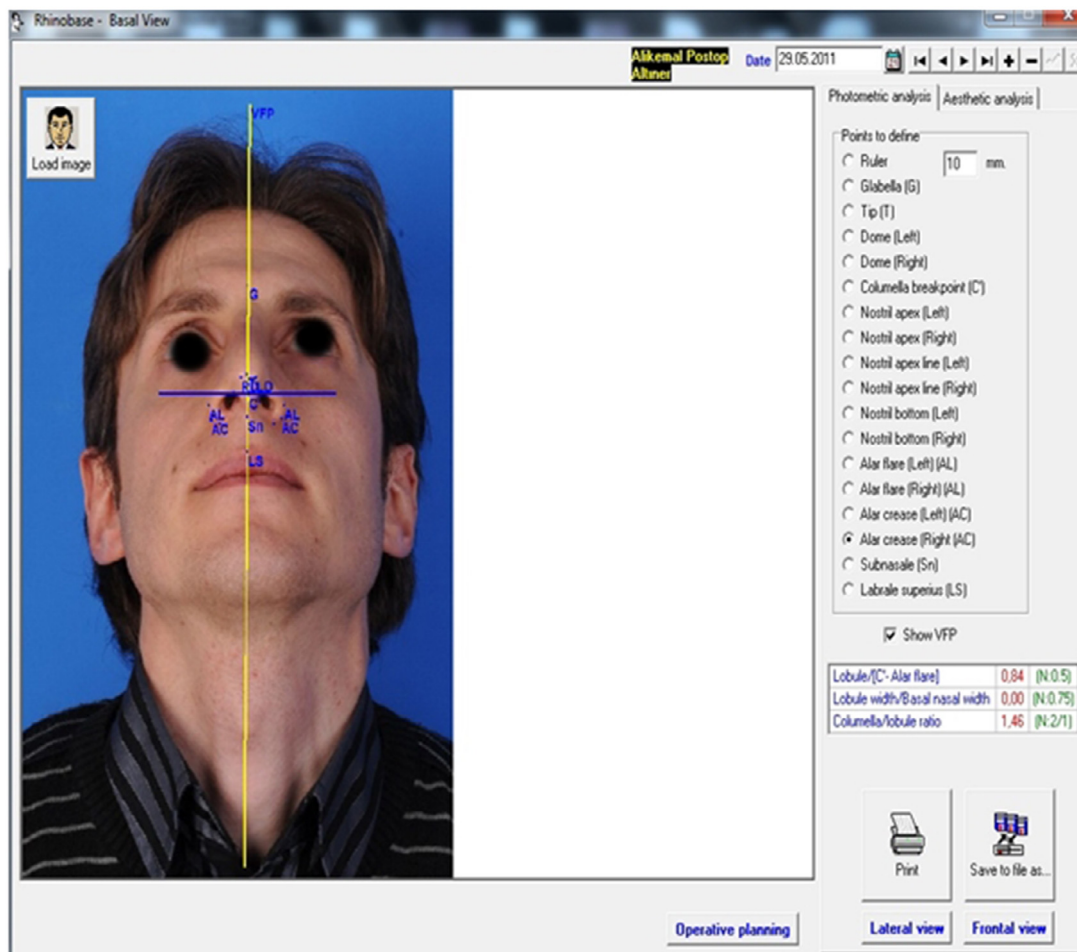
Figure 4 Postoperative basal facial analysis (sixth month).

recording of data that may help the surgeon to check the outcomes of his/her techniques, promoting a surgeon’s professional development. 7,15,16