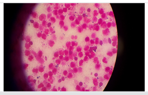
Figure 1. Direct microscopic examination from the abscess sample sent to the laboratory

had type 2 diabetes mellitus, which was not regulated for 5 years and he was followed up with hypertension. Physical examination revealed a fever of 37.2°C and a swelling in 4x4 cm dimensions, stretching from perineum to scrotum, giving perineal induction and suggesting abscess. The number of leukocytes in the complete blood count was 18.5x103/uL, CRP was 4.36 mg/dL(<0.5) and glucose was 4+ in complete urine examination. The surface tissue ultrasonography revealed a heterogeneous hypoechoic collection with dense content and thickening of subcutaneous tissue which was 35x16 mm in diameter, partially extended from the posterior of the scrotum to the perineum, and had debris and septations within the thick wall. The contents of the 30 cc abscess were completely drained with 1 cm incision from the apse surface and sent to the microbiology laboratory. The patient was hospitalized and started empirically intravenous ceftriaxone 2x1 g/day and gentamicin 3x3 mg/kg/day. In addition, antidiabetic treatment for blood sugar regulation was started. In the first follow-up day, mild serous drainage was observed and no collection was observed in the abscess area of the patient with flow in the incisions during the day. Control leukocyte count was 11.8x10<sup>3</sup>/