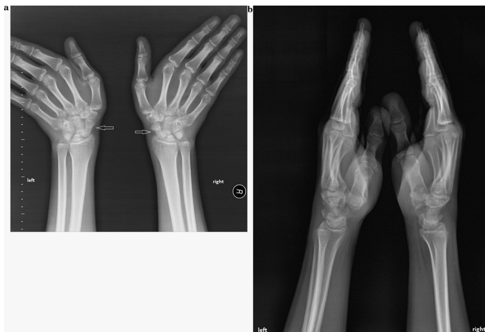
Fig. 2. (a) Full union seen on radiographs after removal of the plaster casts in the 12th week; Anteroposterior radiography. (b) Full union seen on radiographs after removal of the plaster casts; Lateral radiography.

amount of subchondral sclerosis in the other carpal bones, there are no degenerative changes in the bone and the distance between the 2 fragments on the stress radiographs has not changed [8]. After removal of the plaster casts, wrist exercises were started. One month of physical rehabilitation, the patient had regained full range of motion and grip strength in the wrists and returned to full pre-injury activities. After 28 months of treatment with plaster cast,