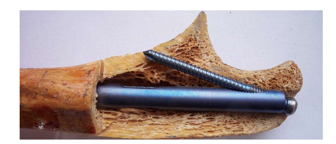
Figure 1 Eccentrically aligned proximal interlocking screw.