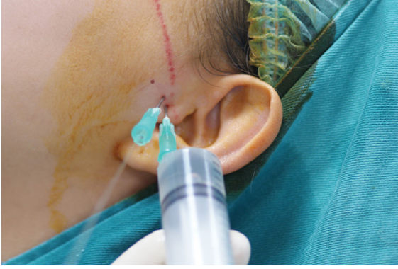
Fig. 2. Effective washout of the joint with the described technique.