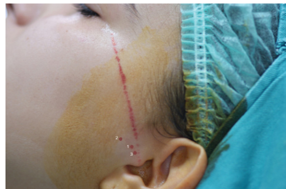
Fig. 1. Placement of the first (1) and second needles (2) in the conventional approach for arthrocentesis of the temporomandibular joint. In the technique that we have described, the second needle (3) is 3 mm posterior to the first needle (1), which was inserted 10 mm anterior and 2 mm inferior along the canthal-tragal line.

We propose a new technique, by which the patients are asked to open and close the mouth several times so that the