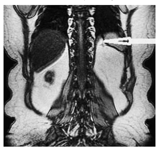
Figure 1. 24*18*22 mm large adrenal adenoma (left side)

We presented an unusual Cushing case that pituitary and adrenal CS were coexisting in the same patient. The combined findings of the right-sided pituitary lesion on MRI and demonstration of the central source of ACTH secretion by BIPSS were considered to be sufficient evidence for CD and she was treated with pituitary surgery. After surgery, because of persisting hypercortisolemia and BIPSS results indicating pituitary source, gamma knife radiosurgery was performed. Three years after gamma knife radiosurgery, hypercortisolemia was still persisting and differential