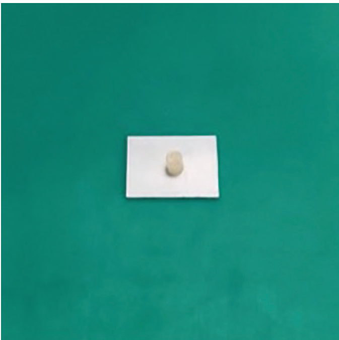
Figure 1. A test sample with 3 mm thick resin layer before being subjected to shear bond strength testing.

MPa: megapascal; SD: standard deviations